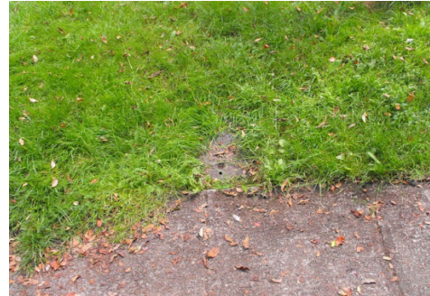
Avoid a meter obscured by grass or debris.