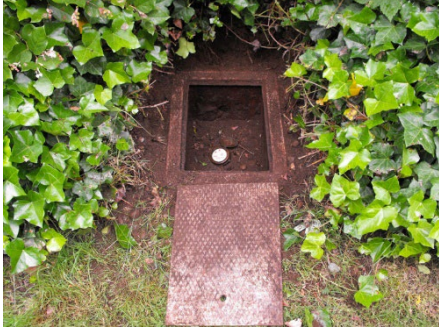
Meter is visible and clear of debris, as preferred.

*See examples below of both obstructed and unobstructed meters as well as tips on how to keep your meter accessible.