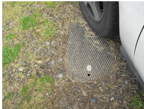
Avoid a meter obstructed by a vehicle or heavy object.